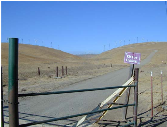
Figure 4. San Joaquin kit fox has long been known to reside at the APWRA. The San Joaquin kit fox, like other canids, is sensitive to the anti-coagulant poisons used to abate ground squirrels with funding provided by wind turbine operators at the APWRA.