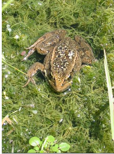
Figure 2. California red-legged frog observed in a pond at the APWRA.