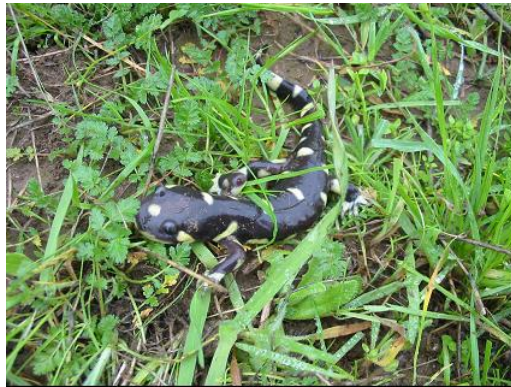
Figure 3. California tiger salamander in the APWRA.